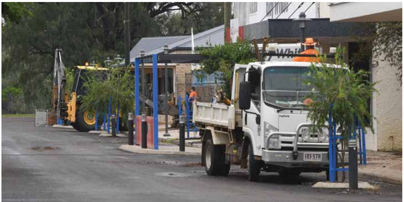
... and in town streets like here in Grey Street, St George.