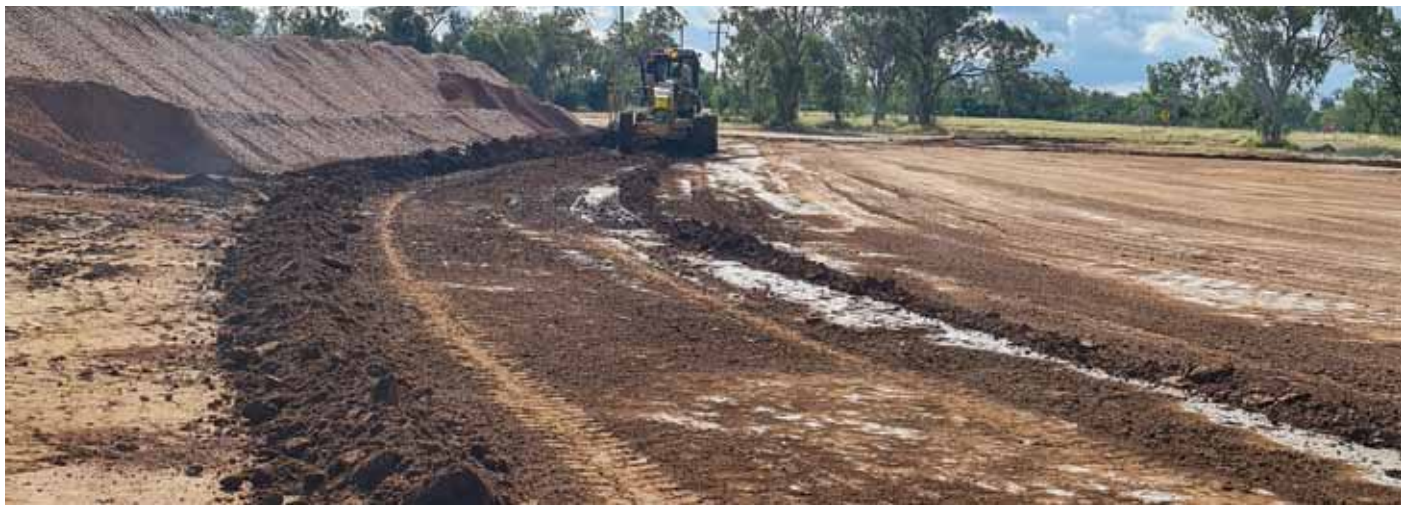
The project is expected to be completed by early August, weather permitting.