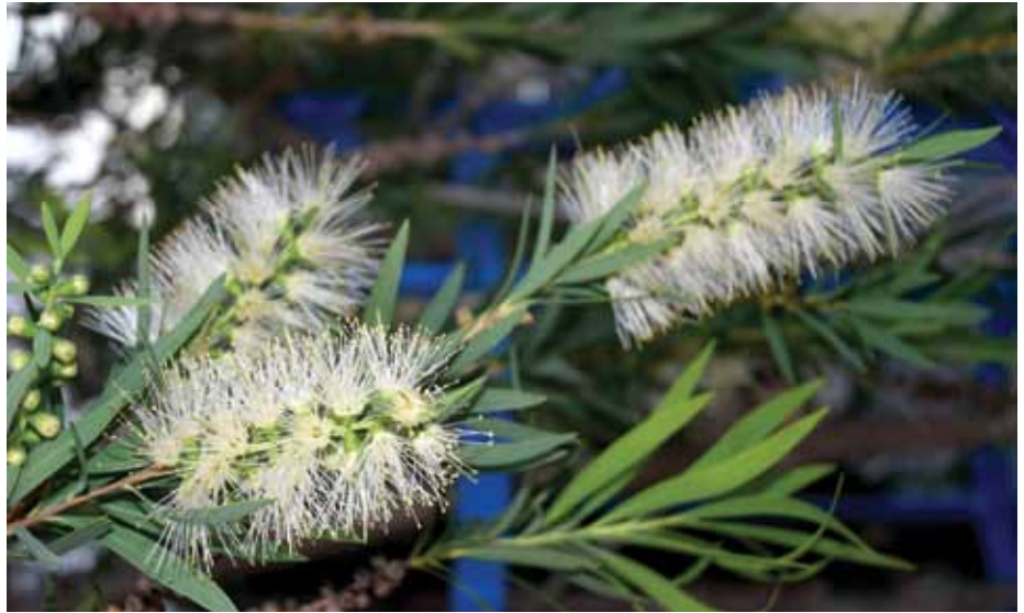
New plantings are already adding colour on our streets.

The program is described as supporting local councils to deliver priority local road and community infrastructure projects across Australia, supporting jobs and the resilience of local economies to help communities bounce back from the COVID-19 pandemic.