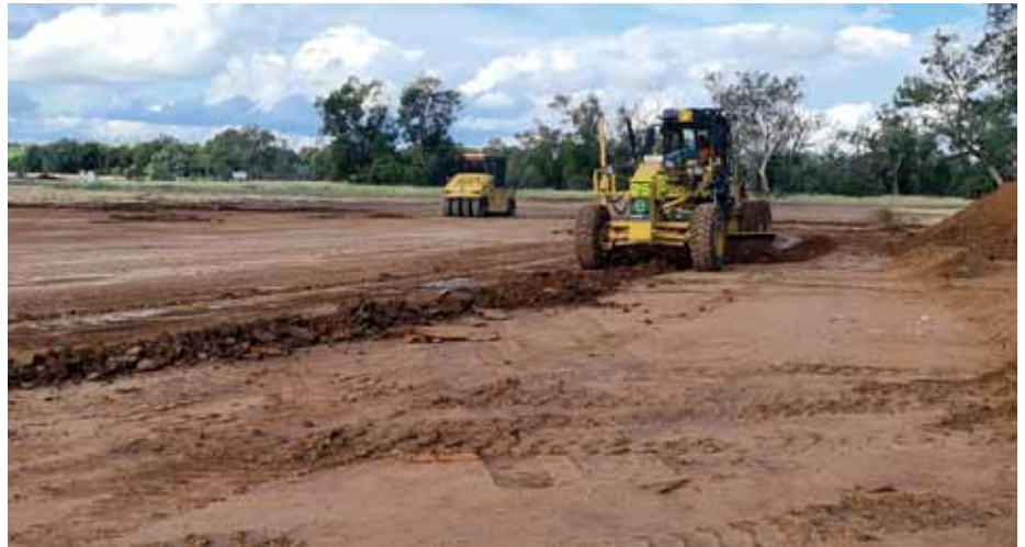
Work has begun on the heavy vehicle breakdown pad in St George.

This project will provide 10 parking bays for type-2 multi-combination vehicles.