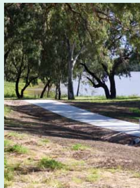
Cameras will be installed along the extended riverwalk in St George.