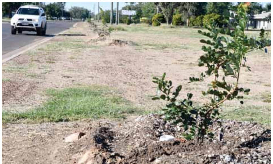
Trees are being planted in suburban streets ...