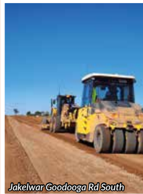
Jakelwar Goodooga Rd South