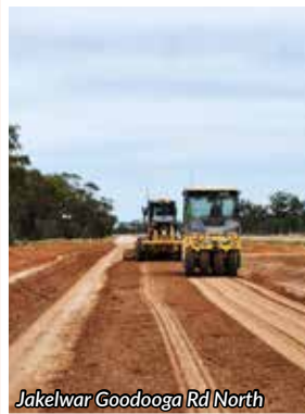
Jakelwar Goodooga Rd North