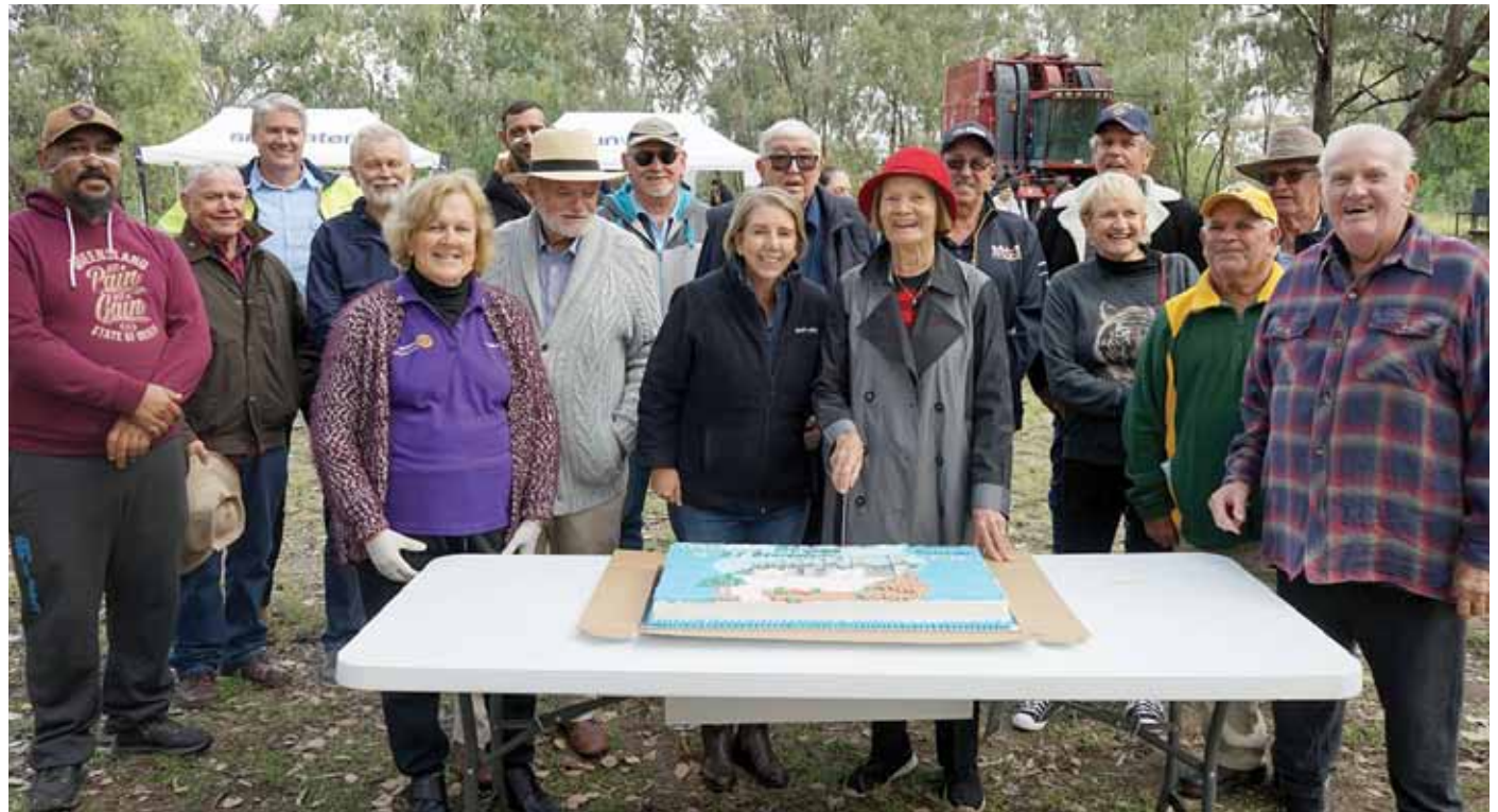
Local residents and staff gathered to celebrate the 50th birthday of Sunwater's EJ Beardmore Dam.