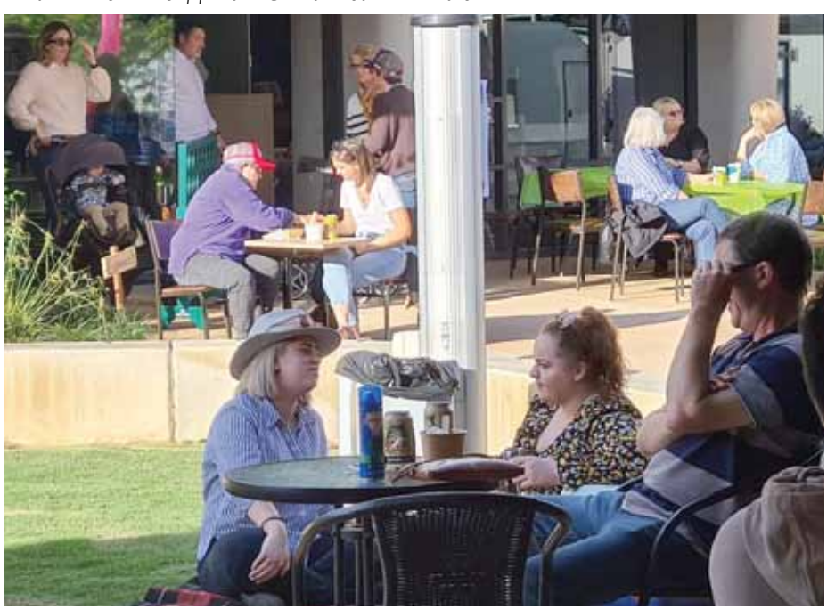
Locals and visitors flocked to the event at The Hub green space in Victoria Street.