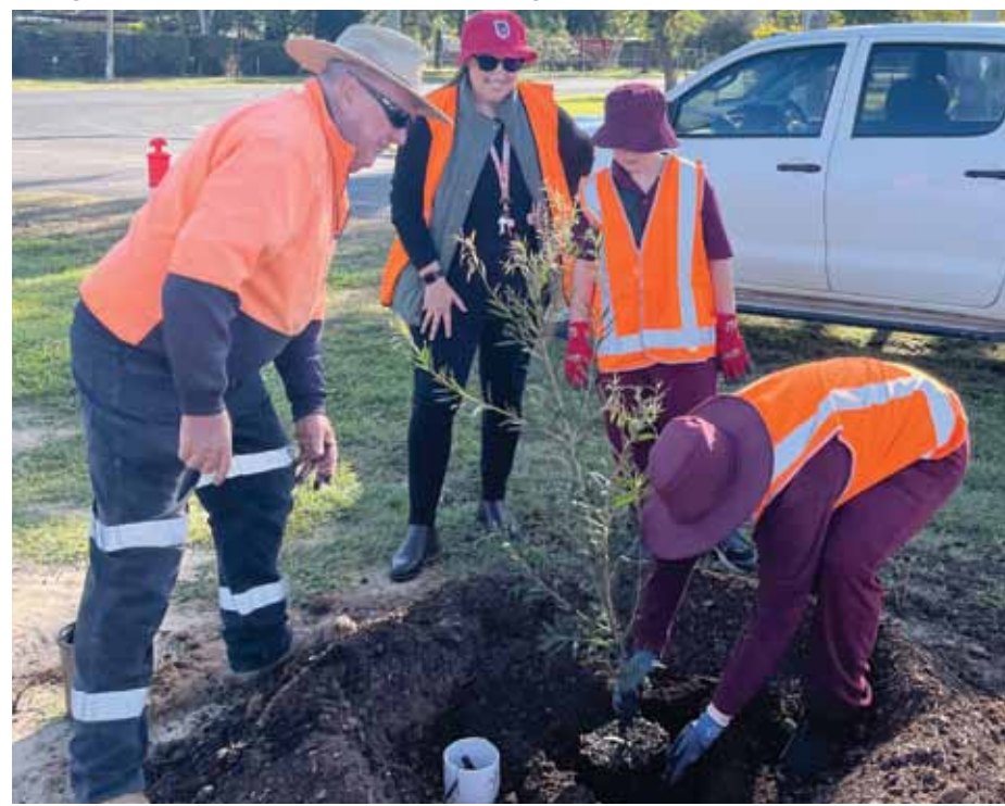
Students from St George State School help plant a Callistemon.

The tree-planting on Bowen Street in St George was funded under the Commonwealth Government's Local Roads and Community Infrastructure Program, which has enabled a broader roadside tree-planting program in the Shire.