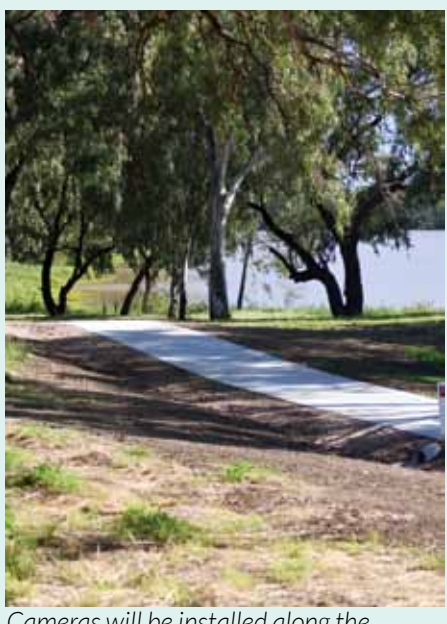
Cameras will be installed along the extended riverwalk in St George.