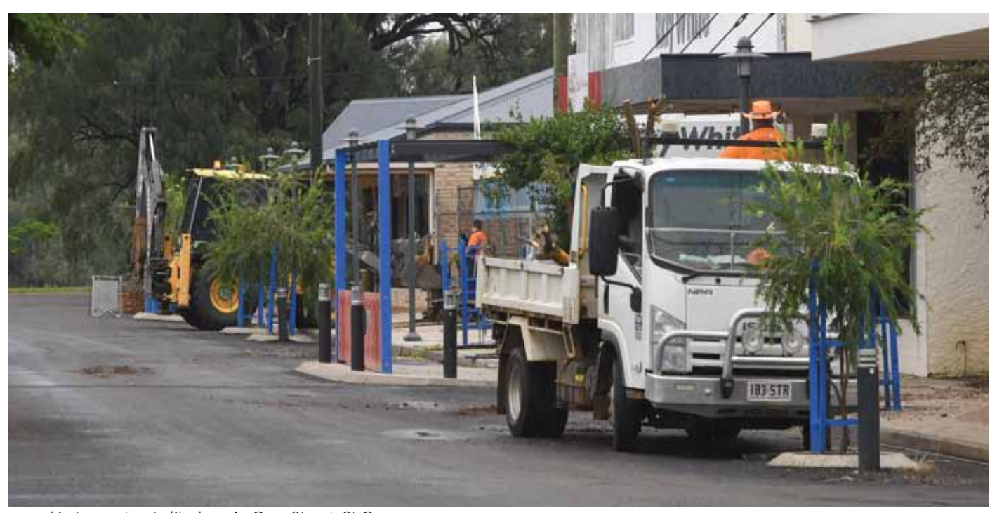
... and in town streets like here in Grey Street, St George.