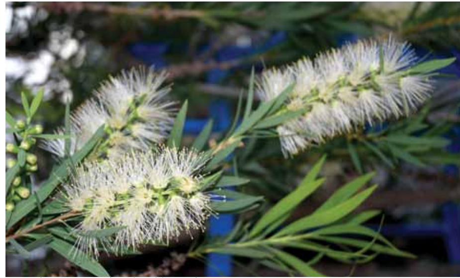
New plantings are already adding colour on our streets.

The program is described as supporting local councils to deliver priority local road and community infrastructure projects across Australia, supporting jobs and the resilience of local economies to help communities bounce back from the COVID-19 pandemic.