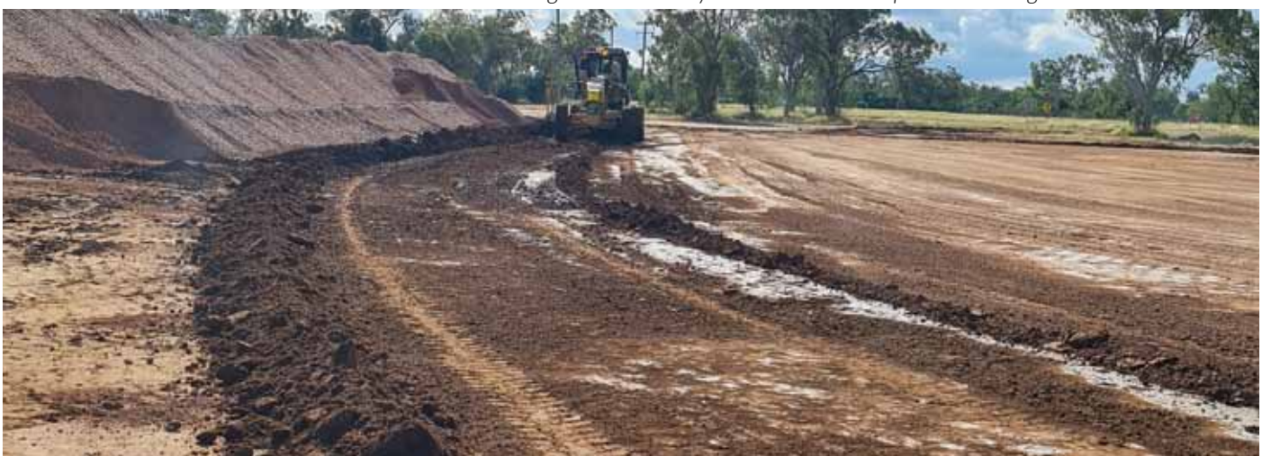
The project is expected to be completed by early August, weather permitting.