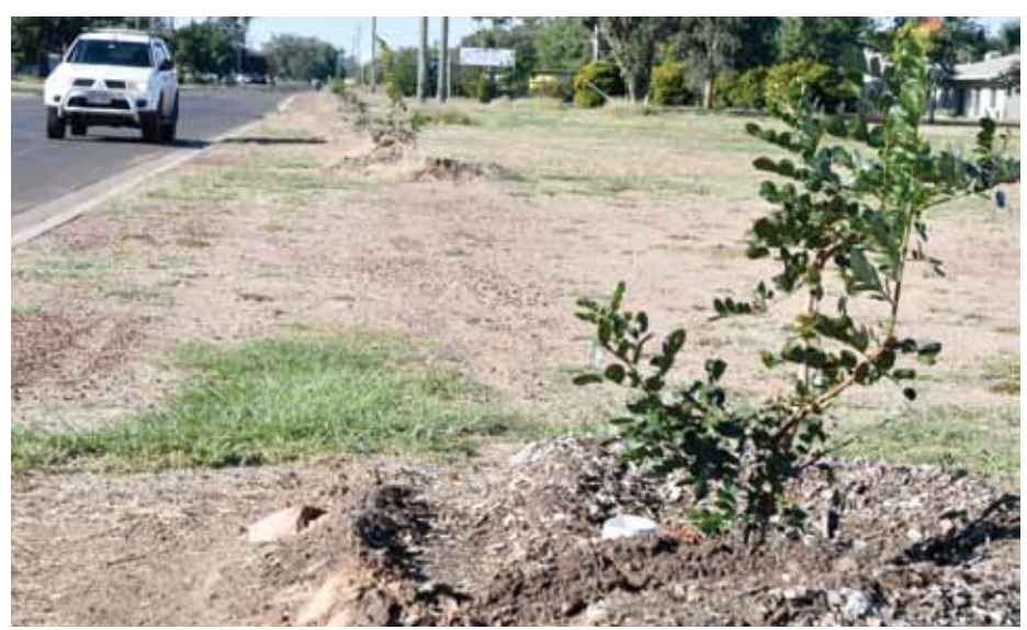
Trees are being planted in suburban streets ...