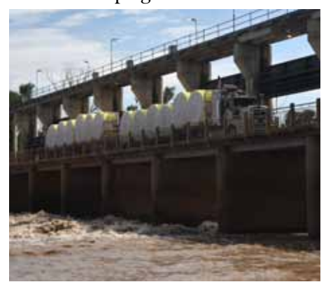
Two of the major events occurring in the Balonne Shire right now captured in one photograph: cotton being trucked for processing and floodwaters pouring downstream (through Jack Taylor Weir).

Council's hard-working tourism staff recently launched this year's tourism campaign.