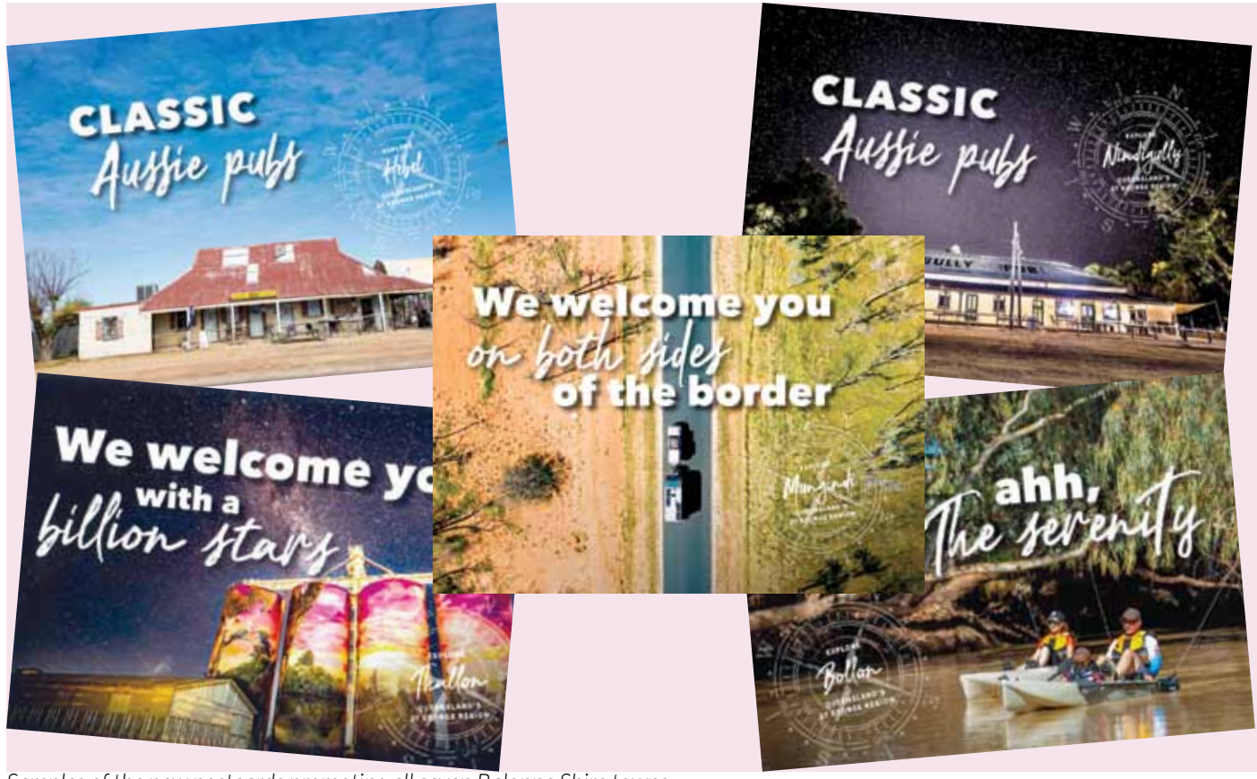
Samples of the new postcards promoting all seven Balonne Shire towns.

great new campaign to encourage an even larger number visitors to visit us, stay longer, and see more of our iconic towns and other attractions."