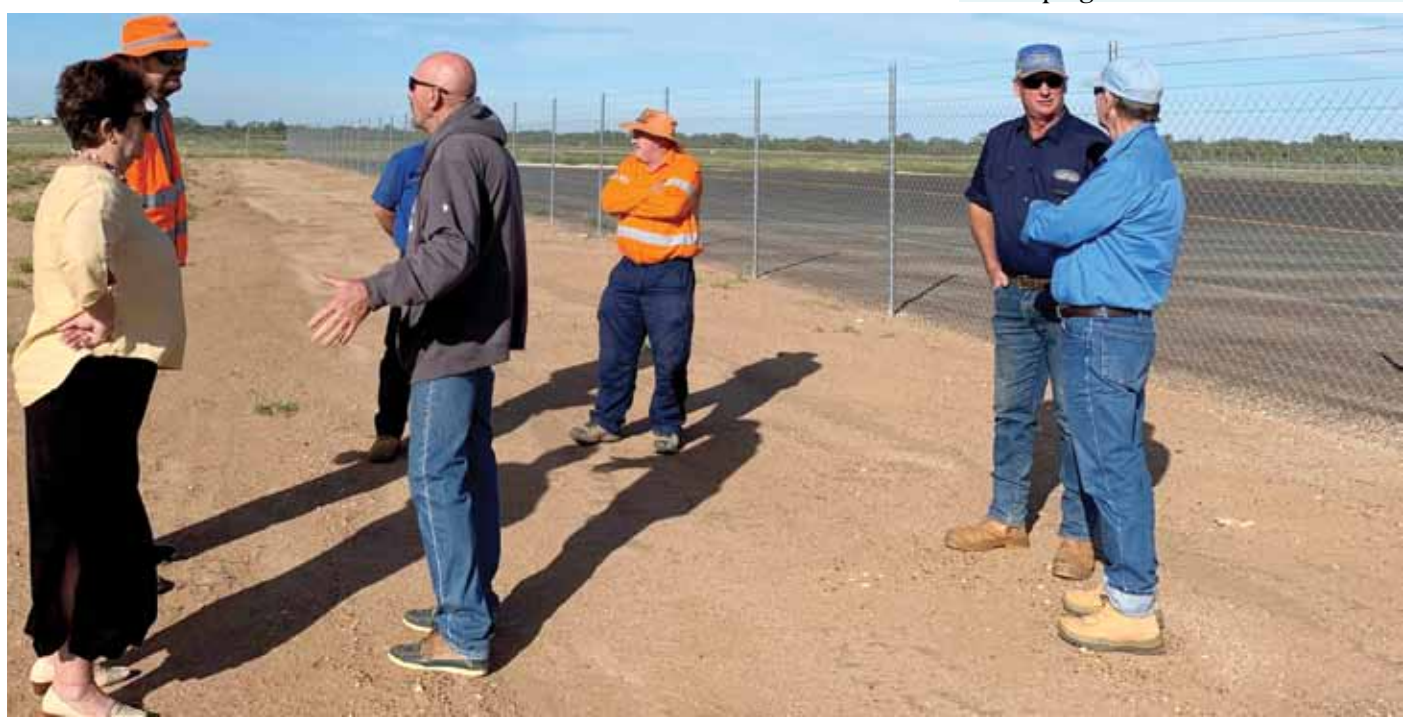
Balonne Shire Councillors inspecting the new allotments available for commercial use at St George Aerodrome.

For more information, check out Balonne Shire Council's current vacancies and traineeships at www.balonne.qld.gov.au