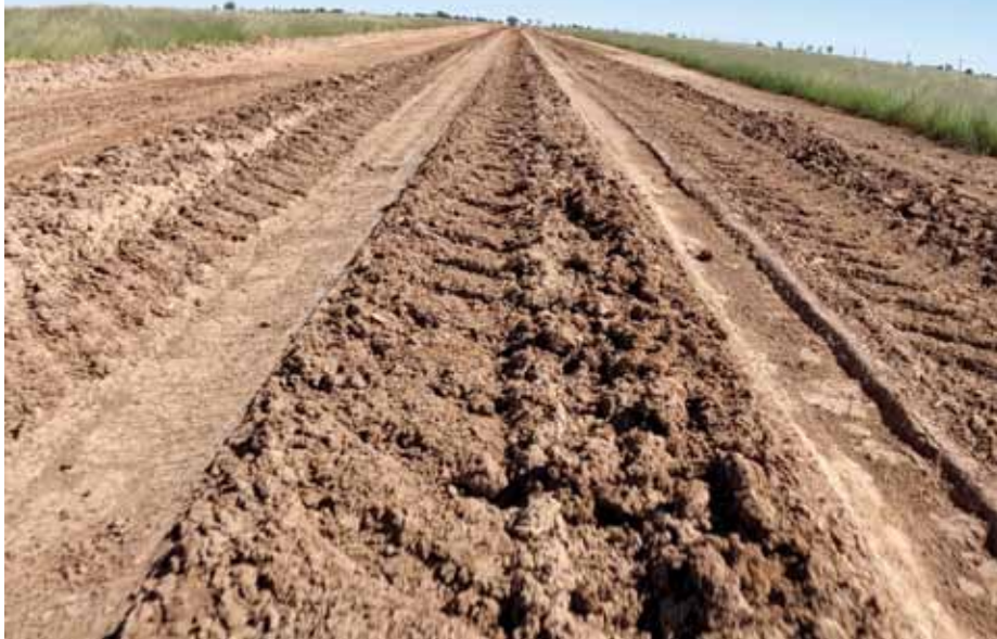
Two separate roads showing damage caused by trucks driven over a saturated surface.