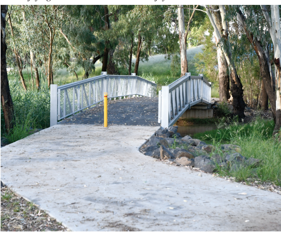
he new pathway will run from the footbridge at the bottom of Church Street ...

"The Balonne River at St George really is a beautiful backdrop to our town and extending the walking path will allow locals and visitors alike to enjoy it even more."