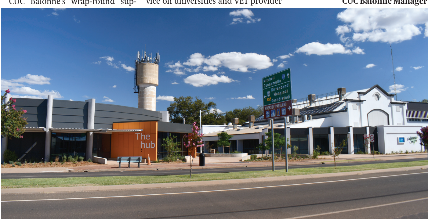
The CUC Balonne campus in St George is housed in the new Hub building on Victoria Street.