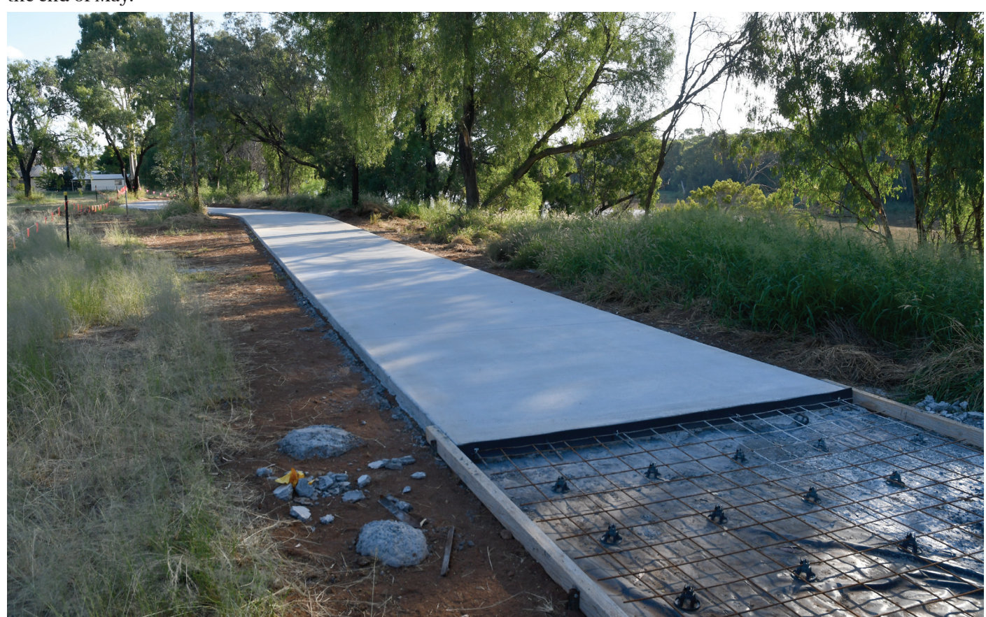
... along the riverbank to McGahan Street, on the far side of the showgrounds.