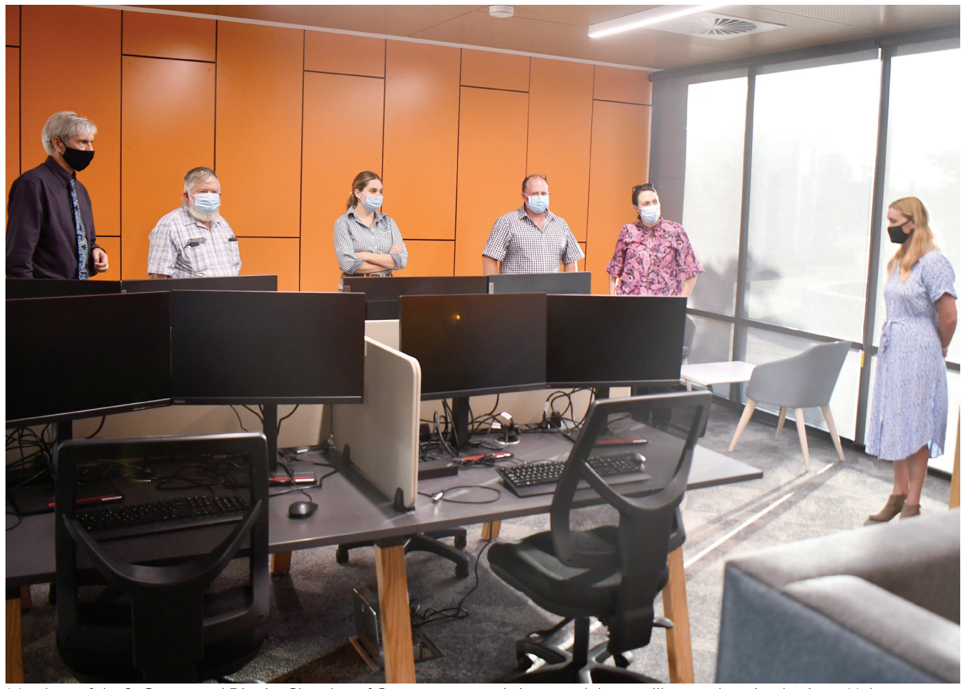
Members of the St George and District Chamber of Commerce recently inspected the new library-education-business Hub...