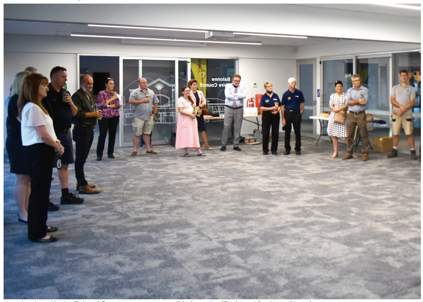
... and gathered in the Cultural Centre to convene one of their regular "Business After Hours" meetings.