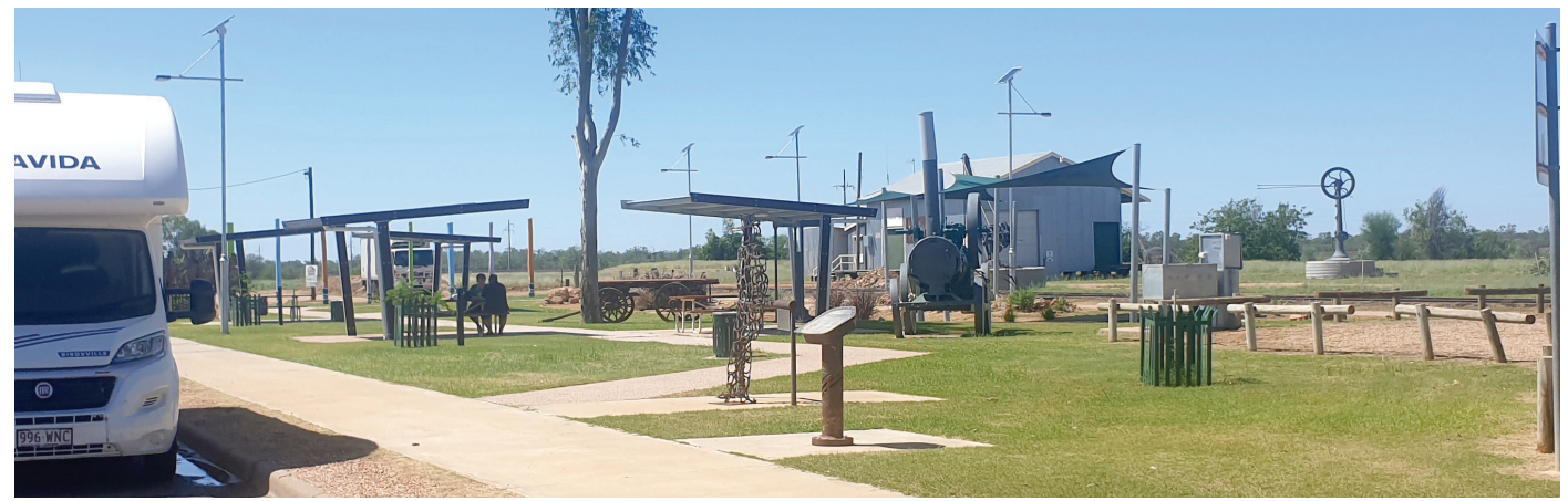
Transfer of Federal Government grant funding from the cancelled Dirran Dip project will see the money spent here at the Rail and River Precinct instead.