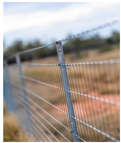
Exclusion Fencing is protecting properties from many different pests

Increased investment and extra employment are expected to flow from the rapid construction of predator-proof fencing throughout the Balonne Shire.