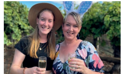
Riversands Easter in the Vines