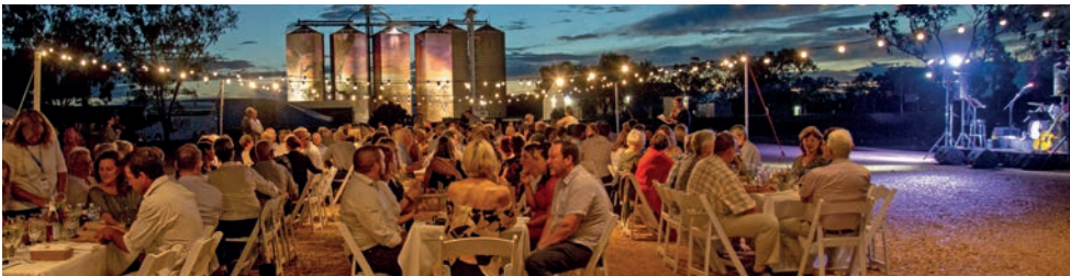
Grazing at the Waterhole in Thallon

For more information on the events funded, visit www.stgeorgeregion.com.au/