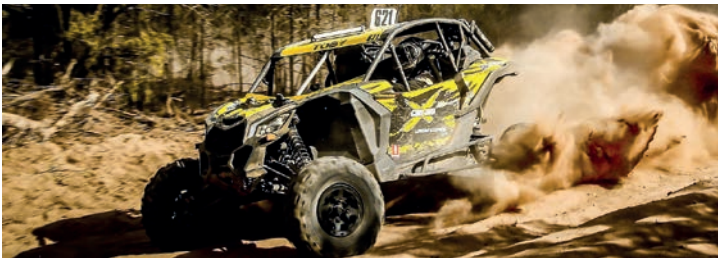
The McIntyre 900