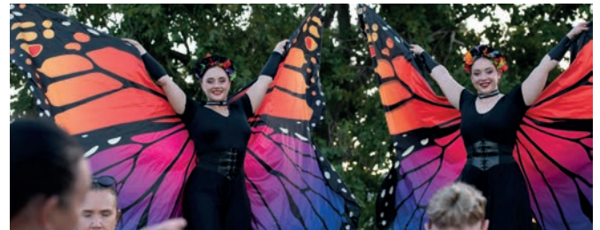
St George Agricultural Show