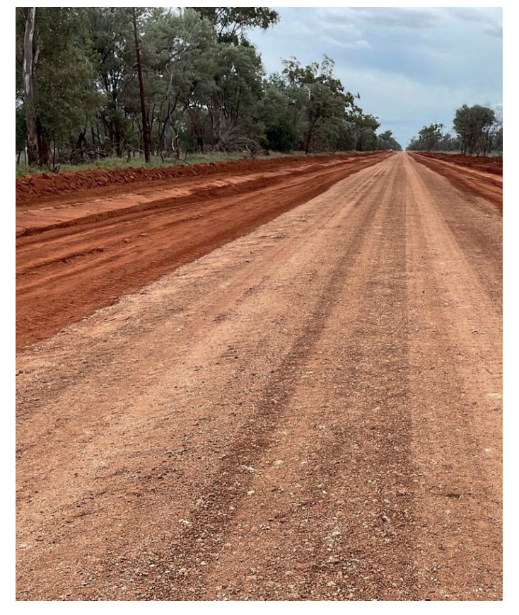
Works have been carried out under the Federal Government's 'Roads to Recovery' Funding on Honeymah Lane to upgrade the road.