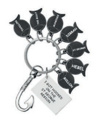
The concept of the campaign includes a collectable key ring similar to the above pictured

An innovative way of marketing the strengths of our region has been recognised at this year's LGAQ Conference with Council taking out the "Let it Shine' award.