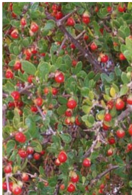
Above: As summer approaches, African Boxthorn is easily recognised by its prolific red berries.