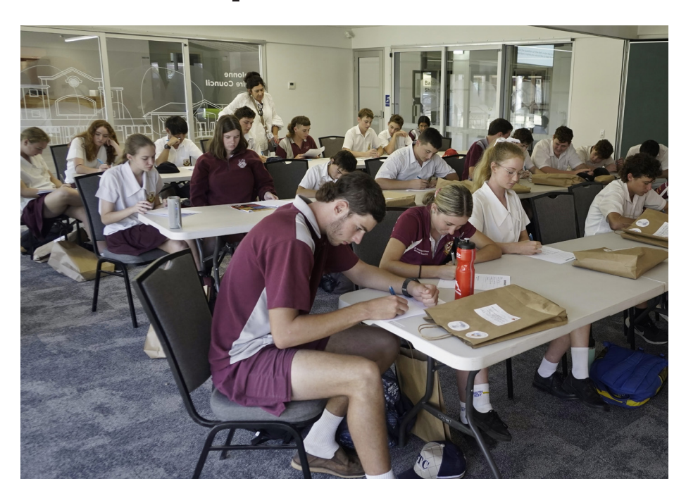
AboveL Local high school students at the 2021 Youth Summit learning about educational pathways and career options. The Learning Opportunities Report makes recommendations for improvements and innivations in local education.

1. It is a great community and people love living in Balonne. There are many natural, community and