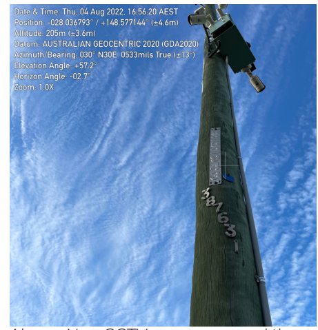
Above: New CCTV cameras around the shire have night vision and long distance viewing range.

cameras from its existing 20, covering the length of our river foreshore and key assets and intersections across town