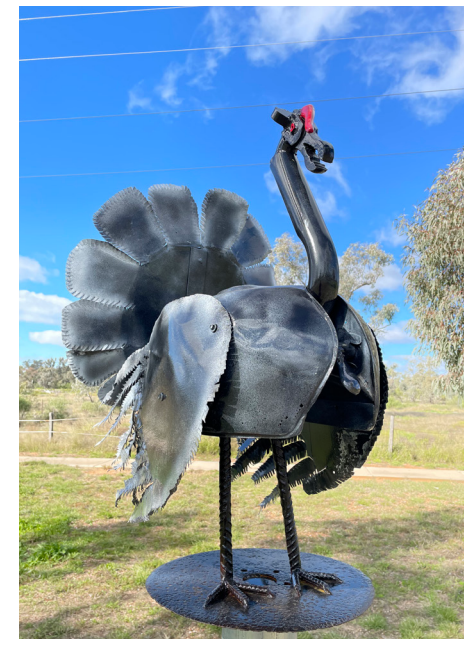
Above: One of the new scupltures to be included on the Mugindi Sculpture Trail. The official opening is on Sunday 18 September.

The official event starts at 10.30am on Sunday 18 September at Barwon River Parkland.