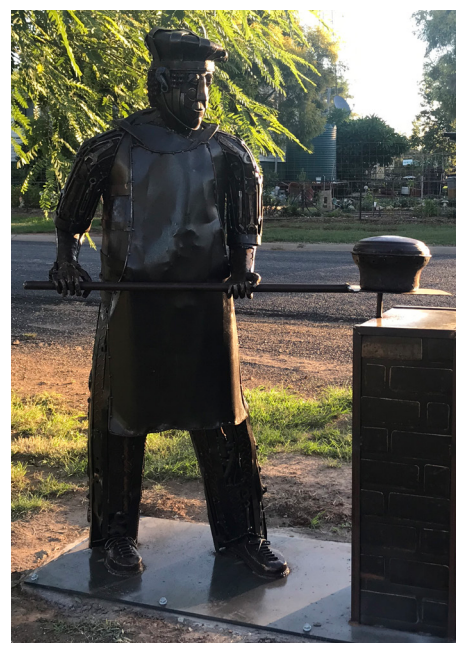
Above: One of the new scupltures to be commissioned and installed in Thallon as part of the Opportunities from Adversity project.

Barely five years after they turned the town around by painting stunning murals on the local silos. the Thallon Progress Association has secured nearly $500K in government funding to make major improvements in the town.