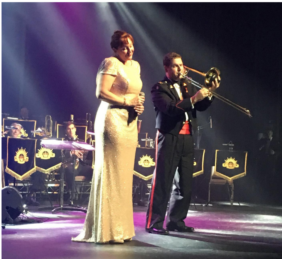
Above: Guests attending the inaugural Mayoral Ball will enjoy music by the Australian Army Band Brisbane

Enjoy music, market stalls, food and fun at this event, which is being held at Dirranbandi Rail and River Precinct. More details will follow in the next Bulletin.