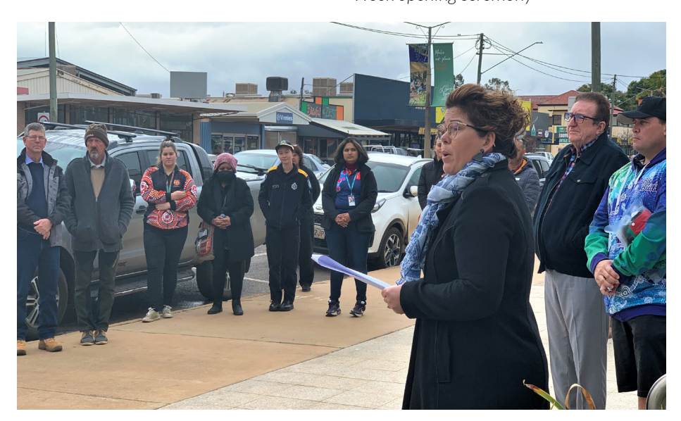
Mayor Samantha O'Toole officially opened the NAIDOC Week celebrations following a march along Victoria Street.