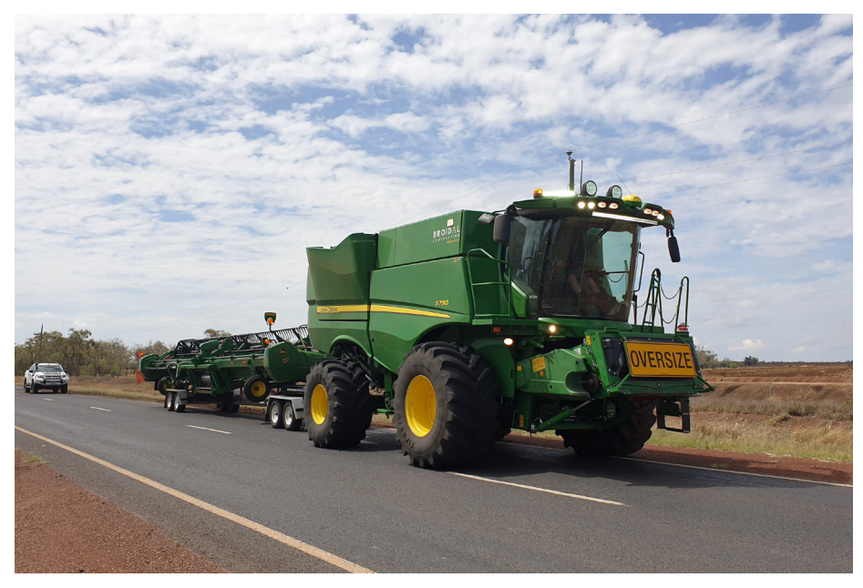
GIVE WAY: Oversize machinery is moving around the Shire during grain harvest. Essential harvest workers can now enter Balonne via Hebel-Goodooga Rd.

Balonne Shire Council completed these works thanks to funding from the Australian Government NHVR Safety and Productivity Program and the Oueensland Government Transport and Infrastructure