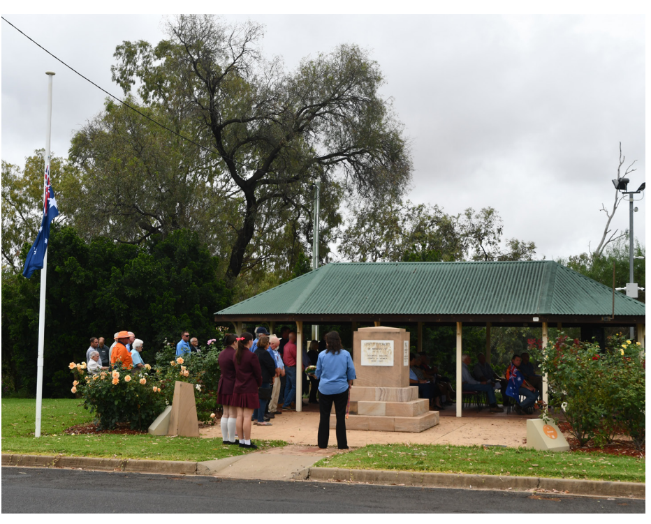
Remembrance Day brought community representatives from throughout the district to the war memorial in St George.