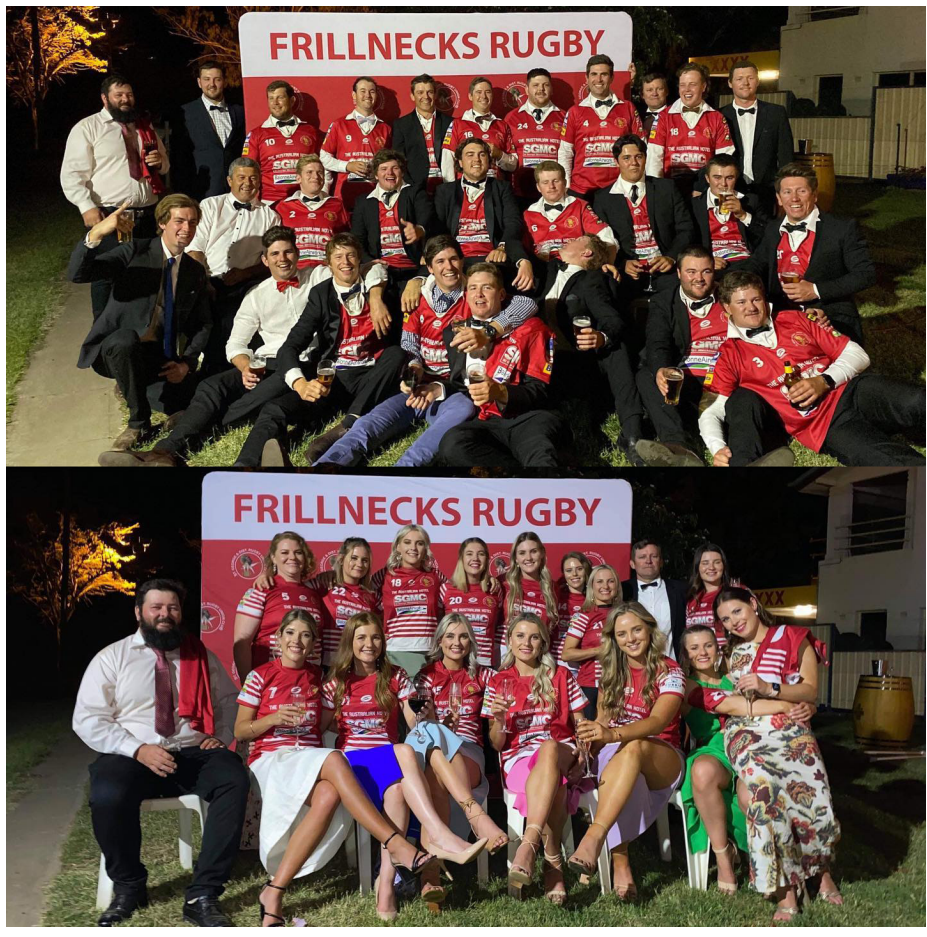
LOOKING SMART: St George Frillnecks men's and women's side officially receive their team jerseys at the club's gala evening.