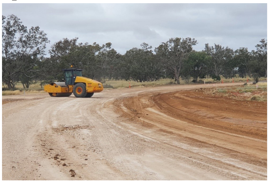
PROGRESS: Council is building roads in compliance with legislated standards.

Q. Gravel trucks are hauling on my road and causing damage; will this be