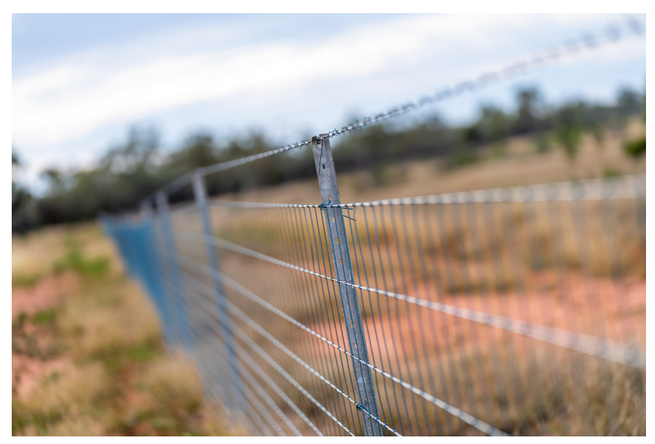
APPLY NOW: $1.5 million in grant funding for Wild Dog Exclusion Fencing is now available. To get on board contact Council.

"Materials costs are capped at $8,000 per linear kilometre, with landholders required to pay for any additional material costs above that