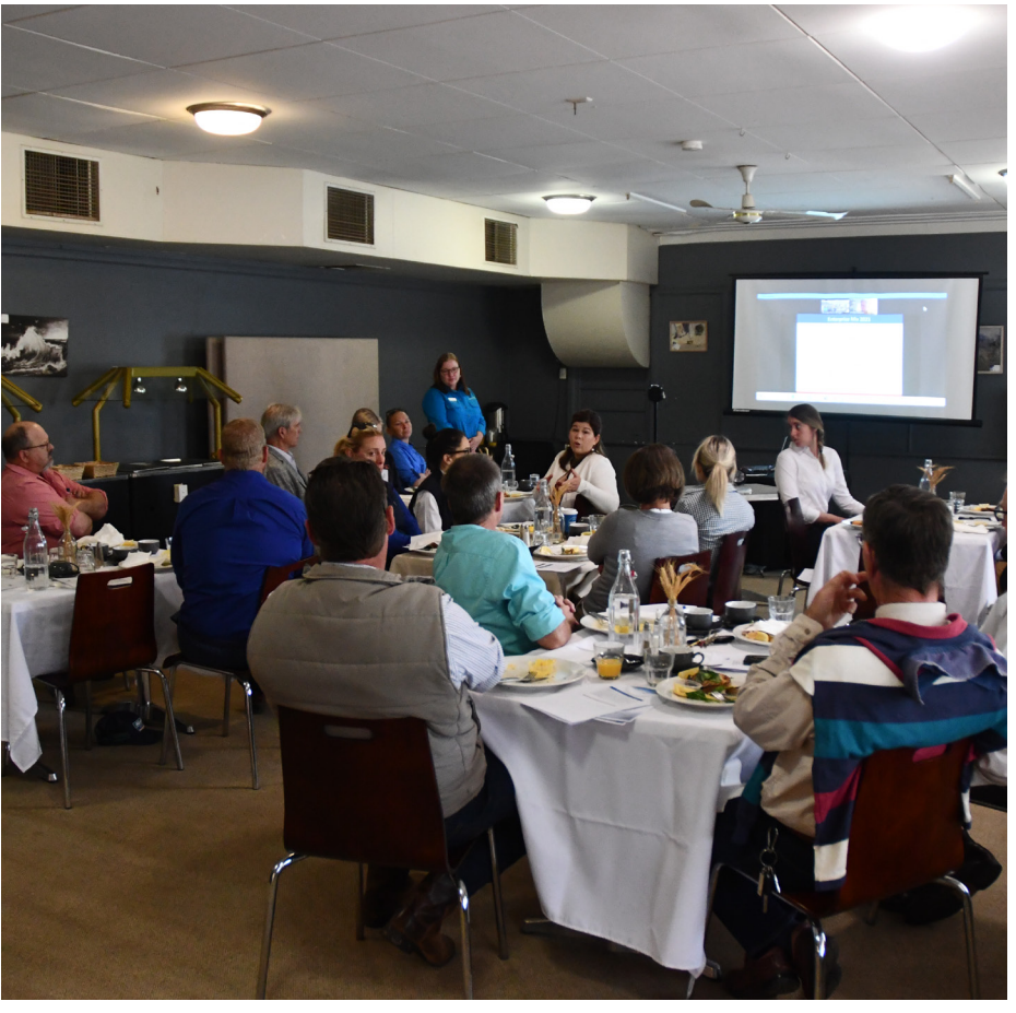
NETWORKS AND EGGS: The Ag Advisors Breakfast was held at the Australian Hotel in early October.

For more information on ConnectAg events, go to: bit.ly/ConnectAg