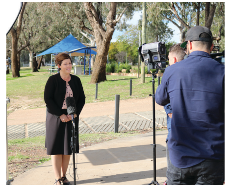
Mayor Samantha O'Toole jumped on camera for 7 News Brisbane.

They discussed the need for extra farm workers as harvest approaches, and the St George Region's exciting promotion to attract more tourists.