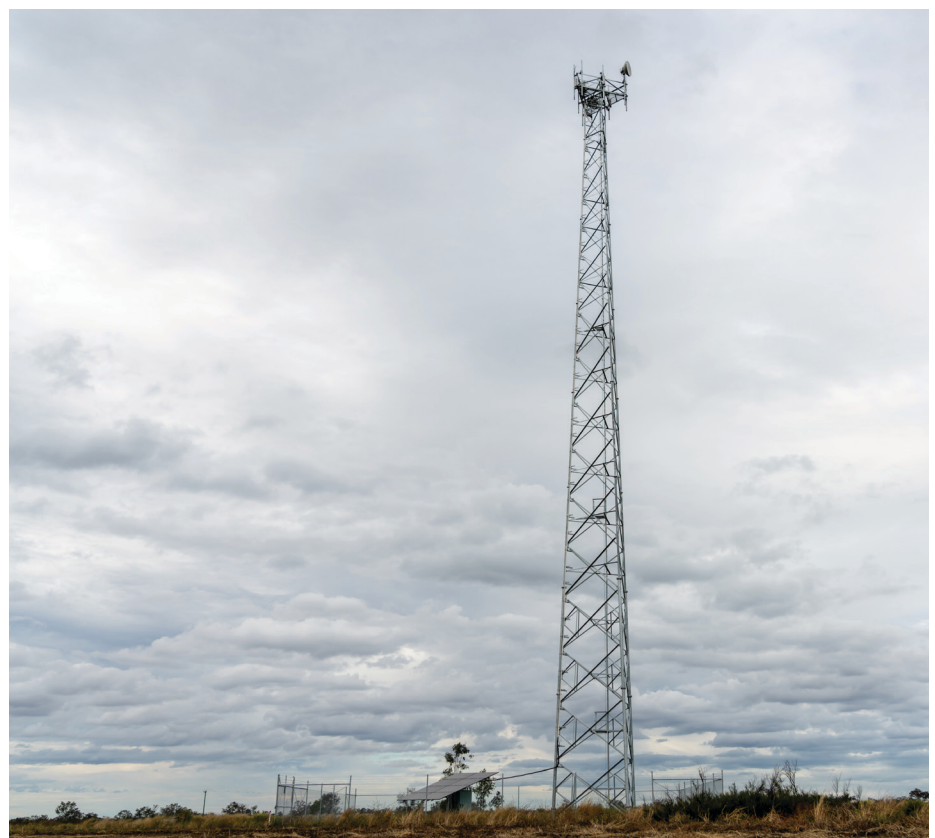
SUPER CONNECTION: This unassuming tower is a key piece of Balonne Shire’s new high-speed fixed wireless internet network, which is already going live.

We all know that being vaccinated is the best way to beat COVID-19 and the more people who are vaccinated across our communities, the better.