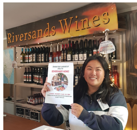
Riversands Wines took us to Italy, pairing local wines with tasty food.