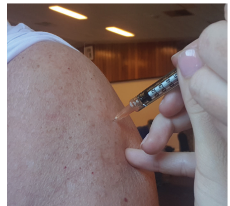
VAX: More than half of all adults in Balonne have received their first dose.