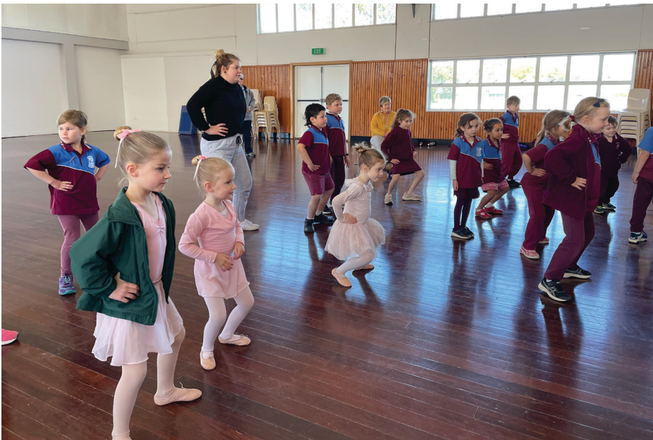
PEITIT POINT: Dirranbandi and Thallon students learn from Queensland Ballet.