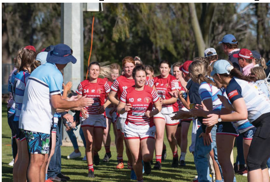
TOUGH TEAM: St George Frillnecks Women's 7's running on to what would become a tough yet thrilling Super Saturday.