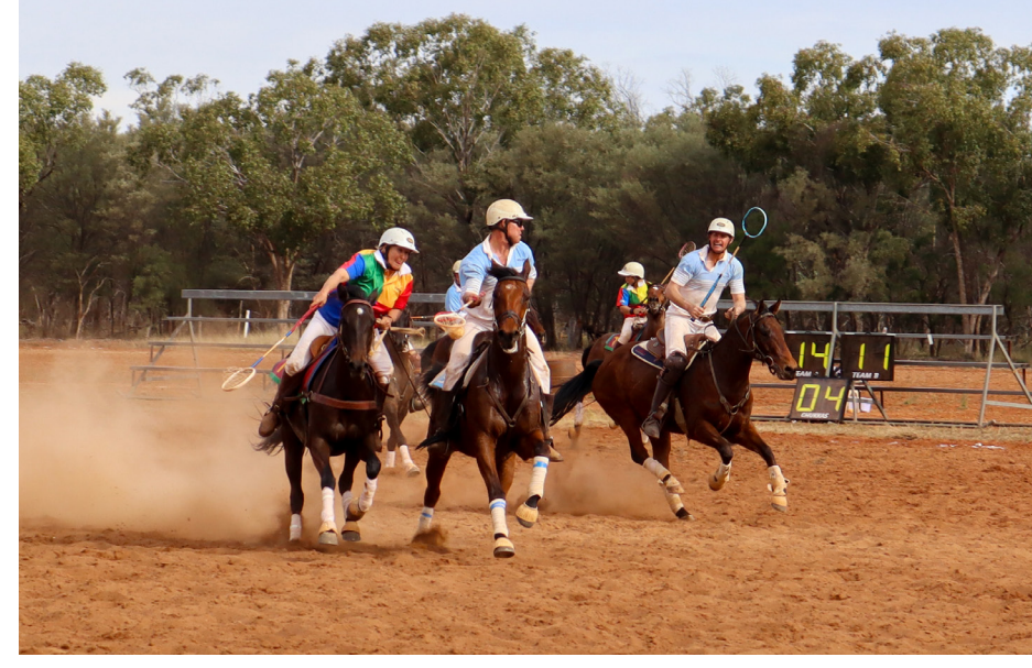
MASTERS OF POLOCROSSE: Bollon played Toompine in the A-grade final at their home carnival, snaring a win to cap off an already successful weekend.