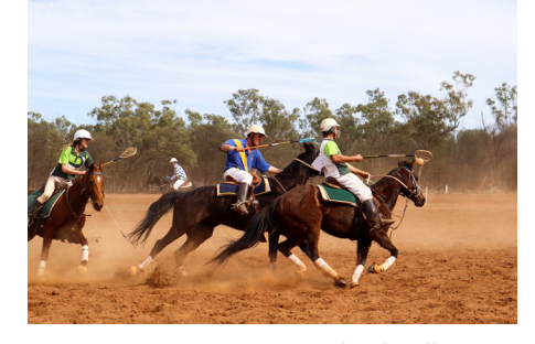
ABOVE AND BELOW: Charleville v Eulo in the C-grade final.