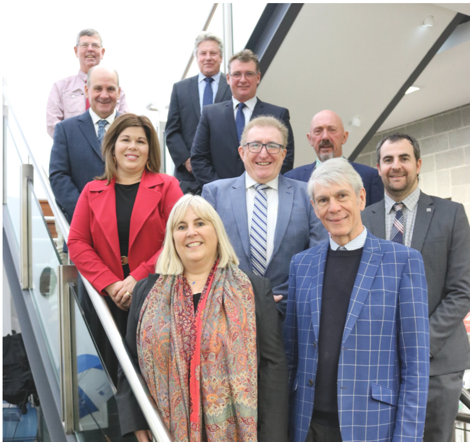
BUDGET COMPLETE: Balonne Shire Councillors and Senior Leadership Group, following adoption of the 2021-22 budget.