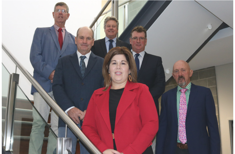
ADOPTED: Balonne Shire Council has finalised the 2021-22 budget.

Council is hoping to secure additional funding to continue Business Mentoring