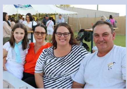
Thallon Christmas Tree